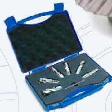
Standard cutter kit

Cutters can also be produced with a wide variety of specialised performance enhancing treatments and cosmetic coatings.