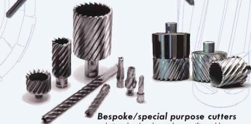
Bespoke/special purpose cutters designed and made to solve specific problems