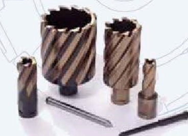
Special treatments/coatings for superior wear resistance