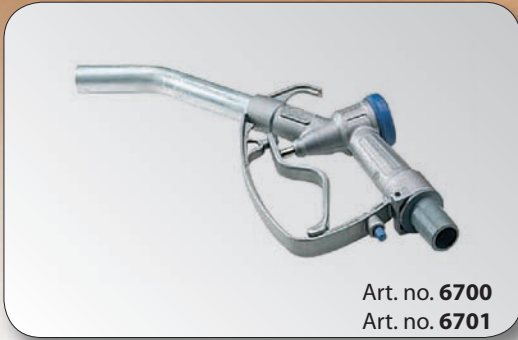
Art. no. 6700

Manual diesel dispensing nozzle, body in aluminium, with plastic hose tail \varnothing 25 mm and dispensing outlet with \varnothing ext. 25 mm, with latch for locking of trigger. Max flow rate 90 l/min. The nozzle can also be used for the dispensing of oils with a max. pressure of 7 bar.