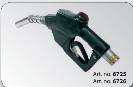
Art. no. 6725

Manual diesel dispensing nozzle, body in aluminium with plastic handle protector, with inlet swivel 1" BSP (M-F) and dispensing outlet with \varnothing ext. 25 mm, with latch for locking of trigger. Max flow rate 150 l/min.