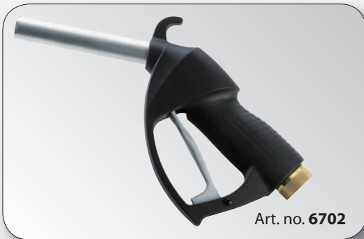
Art. no. 6702

Same as art. no. 6700, but with inlet swivel 1" BSP (M-F).