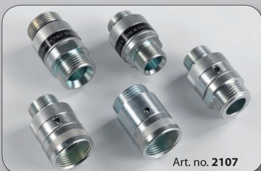
Art. no. 2107