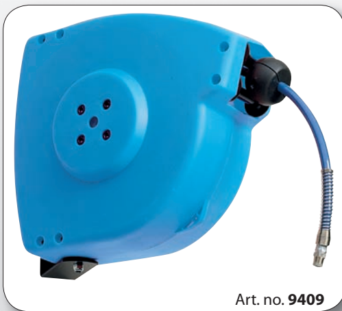
Art. no. 9409