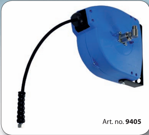
Art. no. 9405