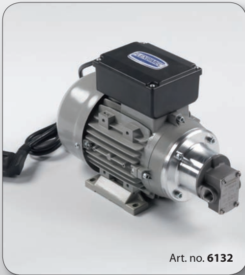
Art. no. 6132