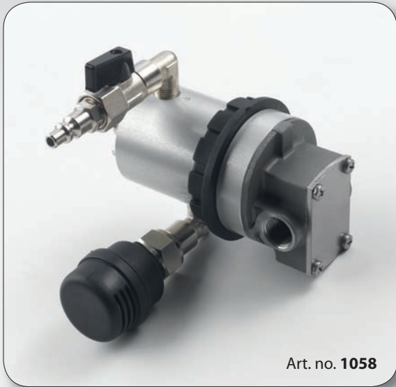
Art. no. 1058

Electric and pneumatic selfpriming pumps, with pump body in stainless steel and PTFE – or Viton® seals, for the supply of fluids with particular chemical characteristics. It is recommended to check the compatibility of the fluid with the materials of the wetted pump components before use.