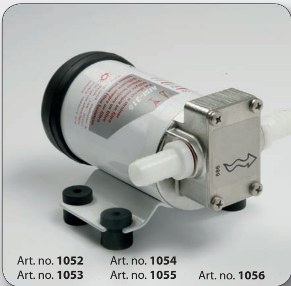
Art. no. 1052 - Art. no. 1053 - Art. no. 1054 - Art. no. 1055 - Art. no. 1056

Electric gear pump, selfpriming, 12 VDC, 24 VDC or 230 VAC, particularly suitable for the use of chemical fluids or in applications where the use of wetted parts in stainless steel is required. Resistant to most acid and alkaline solutions. Suitable also for the transfer of battery acid. Includes an in-line filter. Body and shaft in stainless steel AISI 316, gears in PTFE, gaskets in elastomeric fluorine.