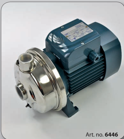
Art. no. 6446