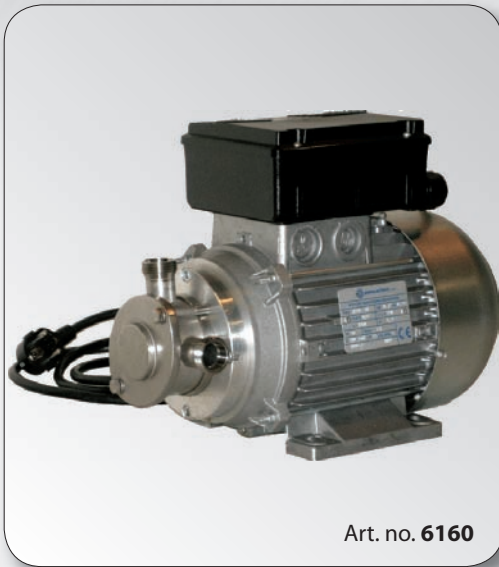
Art. no. 6160

Electric, selfpriming pumps, with pump body in stainless steel AISI 304, for the supply of fluids with particular chemical characteristics. It is recommended to check the compatibility of the fluid with the materials of the wetted pump components before use.