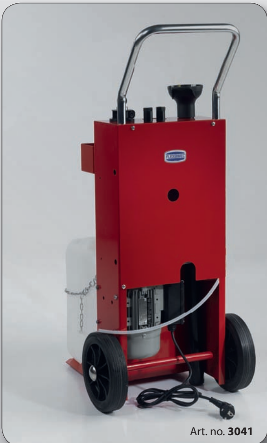
Art. no. 3041