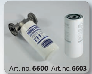
Art. no. 6600 Art. no. 6603