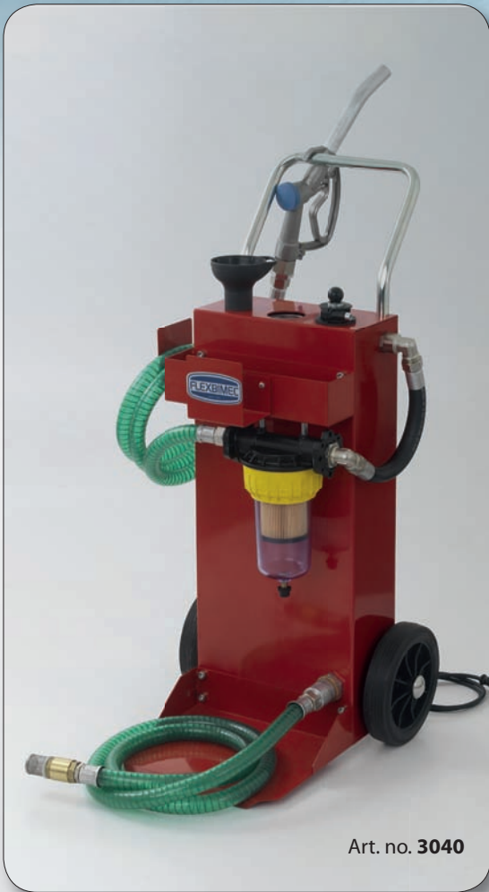
Art. no. 3040