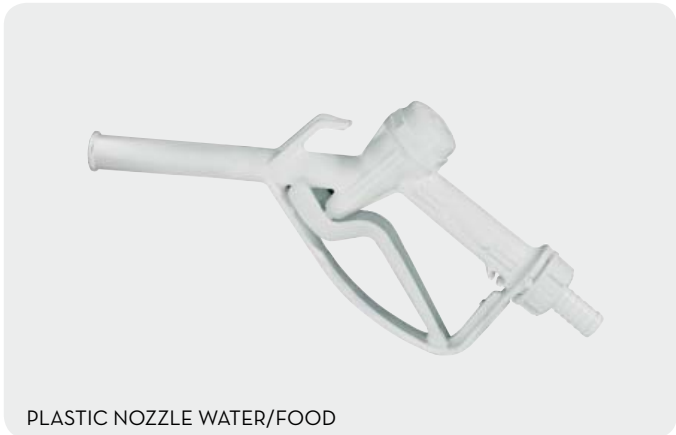
PLASTIC NOZZLE WATER/FOOD