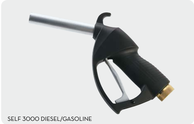
SELF 3000 DIESEL/GASOLINE