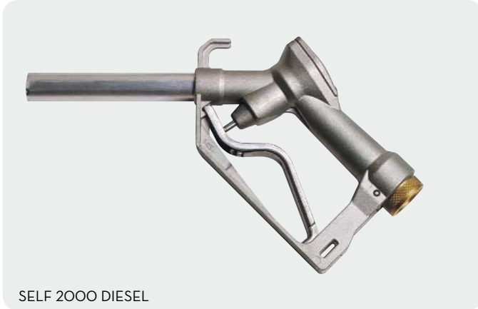
SELF 2000 DIESEL

Flow-rate up to 150 l/min (up to 40 gpm)