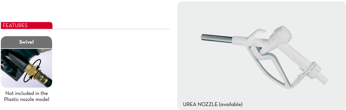
UREA NOZZLE (available)