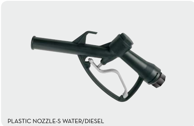
PLASTIC NOZZLE-S WATER/DIESEL