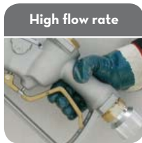
High flow rate