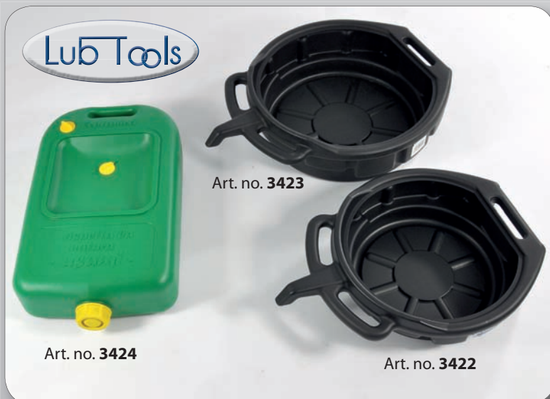
Art. no. 3423