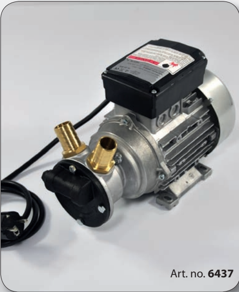
Art. no. 6437

Wall mounting bracket for pneumatic diaphragm pumps art. nos. 8322 – 8323.