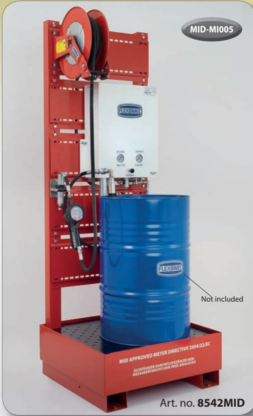
Art. no. 8542MID

Same as art. no. 8543MID, but non - approved version without air separator kit and manometer for outlet pressure, and with electronic flow meter for oil, art. no. 2626 (see page 61!).