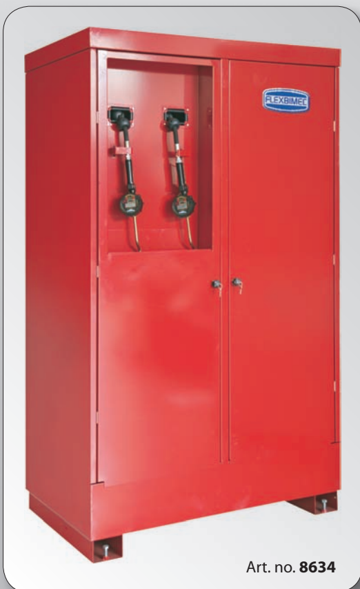
Art. no. 8634