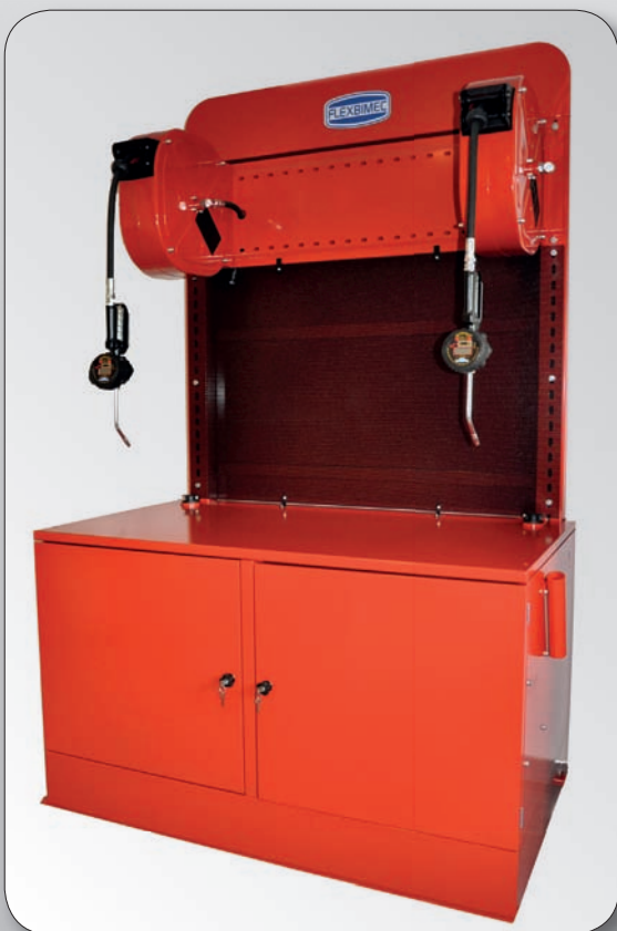
Art. no. 8685

MULTISERVICE LUBE TANK BOX – Multifunctional oil dispensing unit for 2 oil types, with additional useability as workbench.