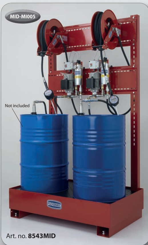
Art. no. 8543MID