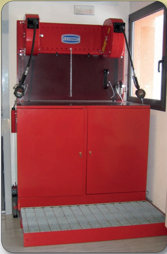
Art. no. 8684

MULTISERVICE LUBE DRUM BOX - Multifunctional oil dispensing unit for 2 oil types, with storage space for 2 drums of 208 l and for the pumping equipment inside of the cabinet. The lockable doors can be opened completely and the included spill containment pallet with grate prevents an eventual spillage of oil into the ground. At the external angles of the containment pallet are mounted 4 detachable feet that allow the lifting of the unit if it must be moved. In the upper part a vertically mounted, perforated panel allows the storage of various tools. The upper surface of the cabinet is provided as a supporting surface and it is divided into 2 parts that can be lifted separately from behind in order to enable the user to facilitate the drum change operations. On top of the upper surface a rubber protection sheet is applied so that it can be used as the worktop of a workbench.