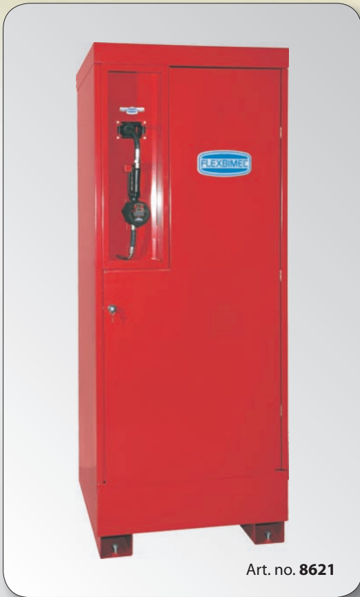
Art. no. 8621