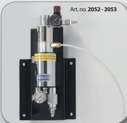
Art. no. 2052 - 2053

Automatic air separator kits, suitable to separate the air eventually present in the suction line from the oil, available with (= art. no. 2053) or without (= art. no. 2052) automatic pump stop device; includes also manometer for the control of the outlet pressure.