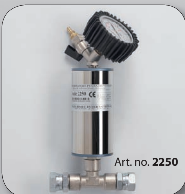
Art. no. 2250

Pulsation damper, with manometer for the control of the outlet pressure, connections 1/2" BSP (F - F), max. pressure 20 bar, suitable for the use with 1:1 - and 3:1 - pneumatic pumps.