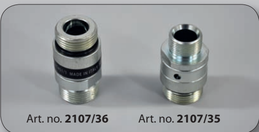
Art. no. 2107/36

Art. no. 2106 Inlet swivel, in galvanized steel, connections 1/2" BSP (M), max static pressure 200 bar.