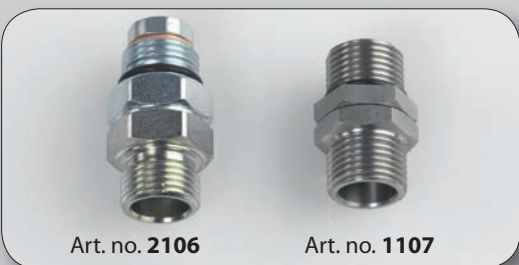
Art. no. 2106

Art. no. 2142 Flexible outlet, Ø 1/2", with curved rigid 90° stem and manual anti-drip nozzle. Connection 1/2" BSP (M).