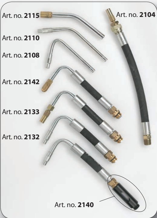
Art. no. 2115

Art. no. 2121 Manual anti-drip nozzle, suitable for outlets of Ø 12 mm. Connection M 10x1 (F).