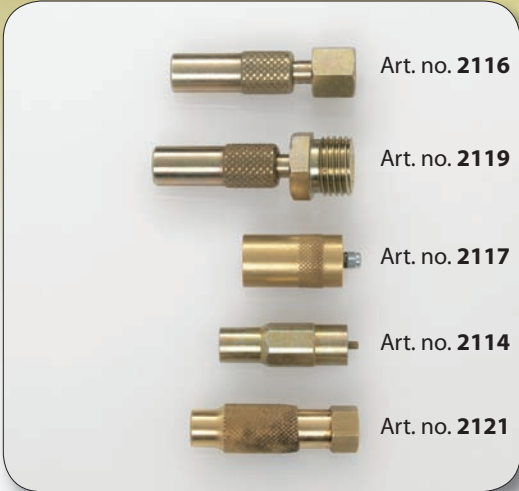
Art. no. 2116