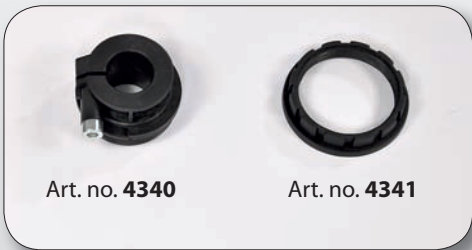
Art. no. 4340

Suction tubes and suction hoses in other lengths available on demand!