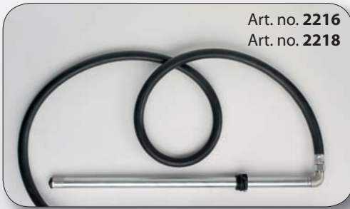
Art. no. 2216 Art. no. 2218

Wall bracket in galvanized steel, suitable for the installation of pneumatic oil pumps, series "Power Bull", art. no. 2098. Dimensions: 290 x 290 x 250 mm - ø cylinder 110 mm. Distances between fixation holes: 230 x 205 mm.