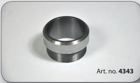
Art. no. 4343

Suction tubes and suction hoses in other lengths available on demand!