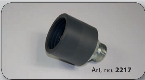
Art. no. 2217