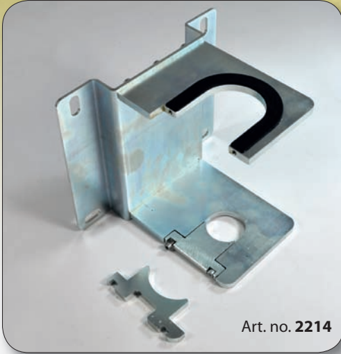
Art. no. 2214