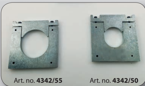
Art. no. 4342/55

Metal bung adapter for the fixation of pumps, series "Power Bull", on drums or tanks. Connection 2" BSP (M) x 55 mm. Suitable for art. nos. 2088 - 2091.