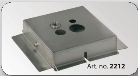
Art. no. 2212

Plastic lock ring, 2", for bung adapter art. no. 4340.