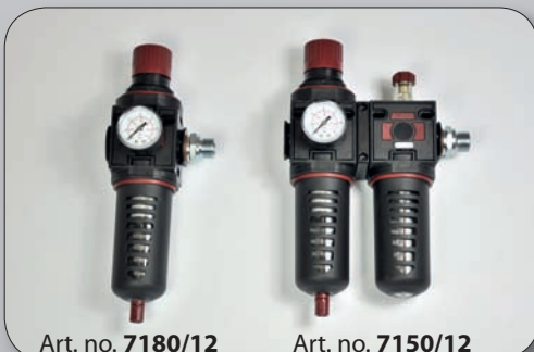
Art. no. 7180/12

Metal flange plate for fixation of pumps, series "Power Bull", with suction tube diameter 55 mm, without bung adapter. Suitable for art. nos. 2088 - 2091 - 2092.