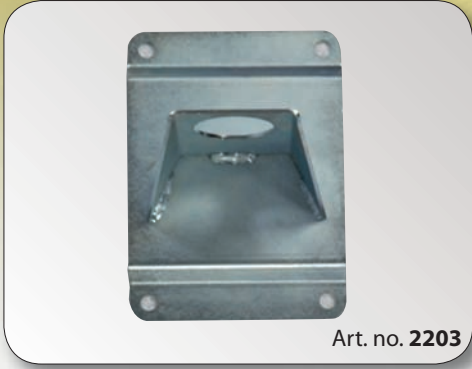
Art. no. 2203