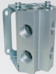
Art. no. 9887