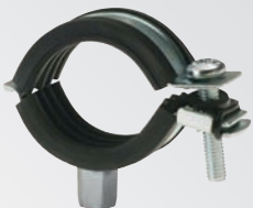
Art. no. 9877