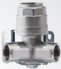
Art. no. 9886