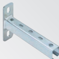
Art. no. 9871