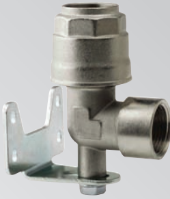
Art. no. 9885