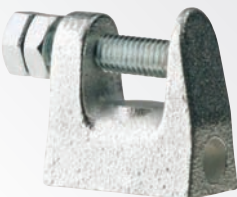
Art. no. 9876