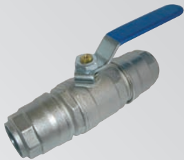
Art. no. 9889