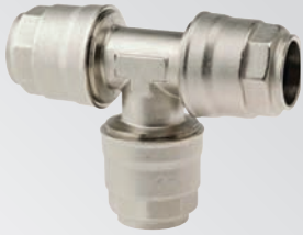
Art. no. 9884