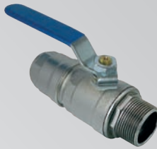
Art. no. 9888