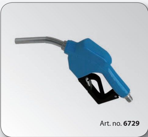
Art. no. 6729

Automatic dispensing nozzle for AdBlue®, body with rubber protection, with Viton® seals, wetted parts and rigid dispensing outlet (ø 19 mm) in stainless steel, swivel hose tail 3/4".