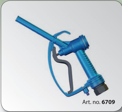
Art. no. 6709

Plastic dispensing nozzle for AdBlue®, internal components in stainless steel, with Viton® seals, wetted parts and rigid dispensing outlet (ø 18,8 mm) in stainless steel, plastic connection hose tail ø 19 mm and lockable trigger.