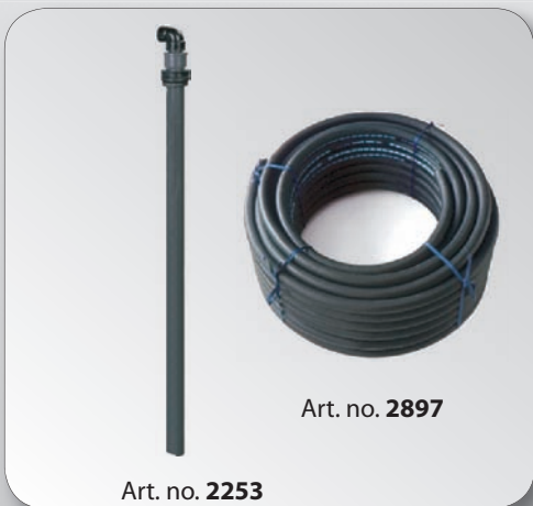
Art. no. 2253

Plastic suction tube, ø 40 mm, length 1100 mm, with bung adapter 2" BSP for fixation on drums or tanks and 90° - elbow adapter ø 25 mm for hose connection. Suitable for 1000 l - IBC - tanks.