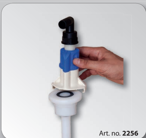
Art. no. 2256

Suction kit for AdBlue® drums and tanks, composed of plastic suction tube (in HDPE) with plug head BCS 56x4 and foot valve, and SEC/CDS - suction coupling with 90° - elbow hose tail ø 20 mm for hose connection.