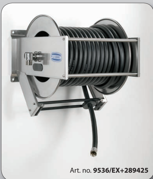
Art. no. 9536/EX+289425