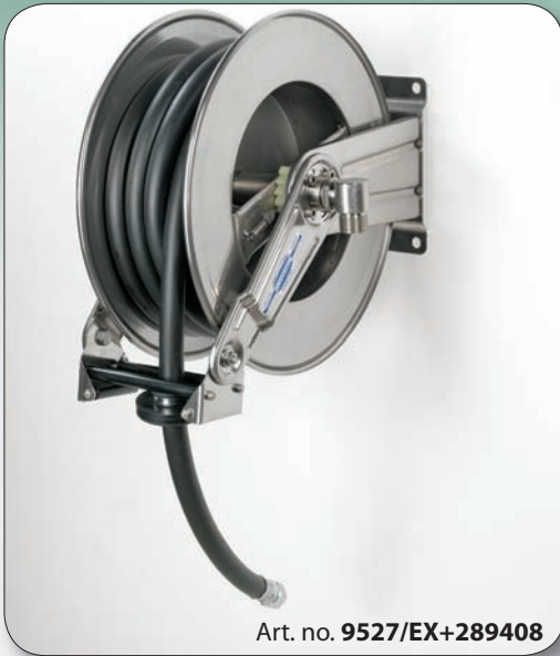
Art. no. 9527/EX+289408