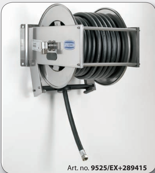
Art. no. 9525/EX+289415