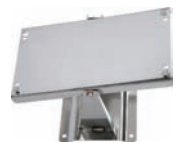
Art. no. 9764