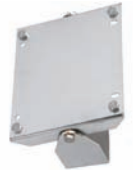
Art. no. 9765