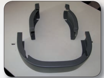
Art. no. 9779

Distance cover, for the mounting in between the hose reels, including all mounting accessories.