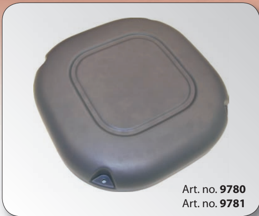
Art. no. 9780

Plastic enclosures suitable for hose reel art. no. 9013; by mounting these enclosures it is possible to create a hose reel battery, improving the esthetic effect.