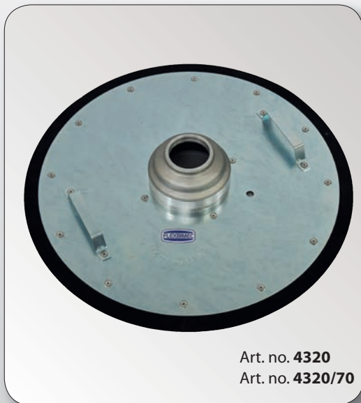
Art. no. 4320 Art. no. 4320/70

Metal drum cover such as art. no. 4309, but including bung adapter with diameter of bore for suction tube of 70 mm. Suitable for art. nos. 4046 and 4047.