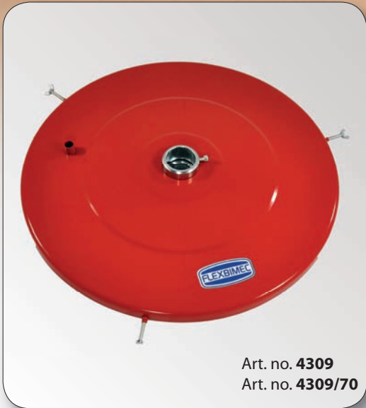
Art. no. 4309 Art. no. 4309/70