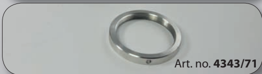
Art. no. 4343/71

Metal bung adapter for fixation of pumps, series "Power Bull", 2" BSP (M) x 70 mm, on drums. Suitable for art. nos. 4046 and 4047.