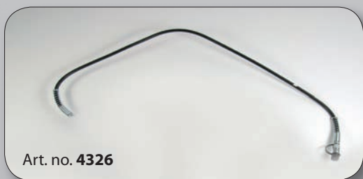
Art. no. 4326

Plastic bung adapter for fixation of pumps, 2" BSP (M) x 40 mm.