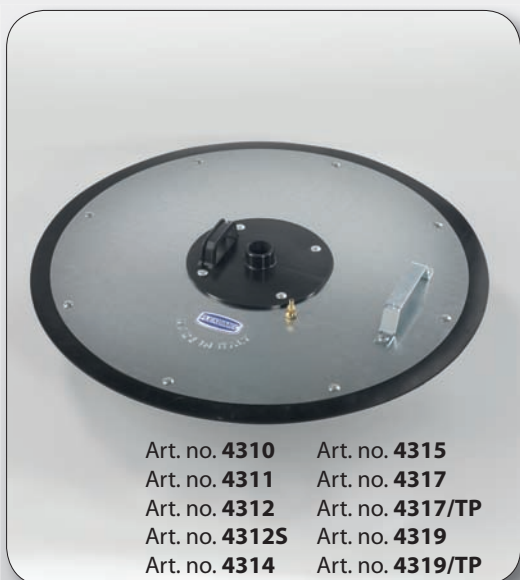
Art. no. 4310 Art. no. 4315 Art. no. 4311 Art. no. 4317 Art. no. 4312 Art. no. 4317/TP Art. no. 4312S Art. no. 4319 Art. no. 4314 Art. no. 4319/TP

Follower plate with rubber edge, available in different dimensions to suit to the various types of grease drums. The follower plate causes a constant grease level inside of the drum and helps to avoid any air pockets inside of the grease close to the suction tube as well as any disposals of grease on the inner surface of the drum.