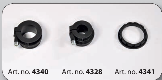
Art. no. 4340 Art. no. 4328 Art. no. 4341