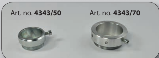
Art. no. 4343/50

Follower plate such as art. no. 4320, but diameter of bore for suction tube 70 mm. Suitable for art. nos. 4046 and 4047.