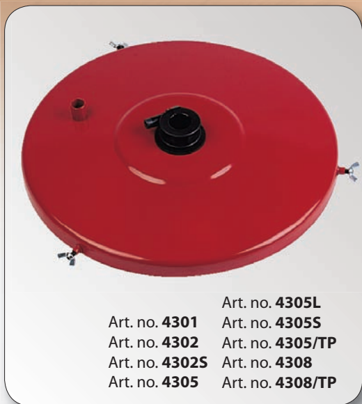
Art. no. 4301 Art. no. 4305L Art. no. 4302 Art. no. 4305S Art. no. 4302S Art. no. 4308 Art. no. 4305 Art. no. 4308/TP

Metal drum cover, available in different dimensions to suit to the various types of grease drums, including butterfly screws for the fixation of the cover on the drum as well as bung adapter for the fixation of the pump in vertical position.